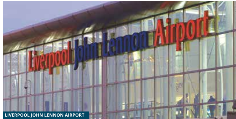
LIVERPOOL JOHN LENNON AIRPORT