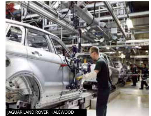
JAGUAR LAND ROVER, HALEWOOD